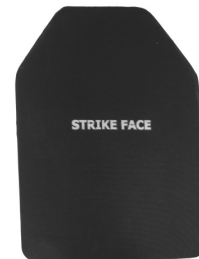
LBP5 IV - L